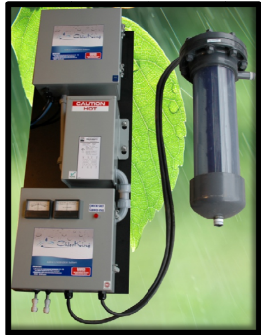
ChlorKing® single cell, commercial design for any size pool.

Why use multiple cells when one ChlorKing® system will do the job? (Typical install with multiple cells)